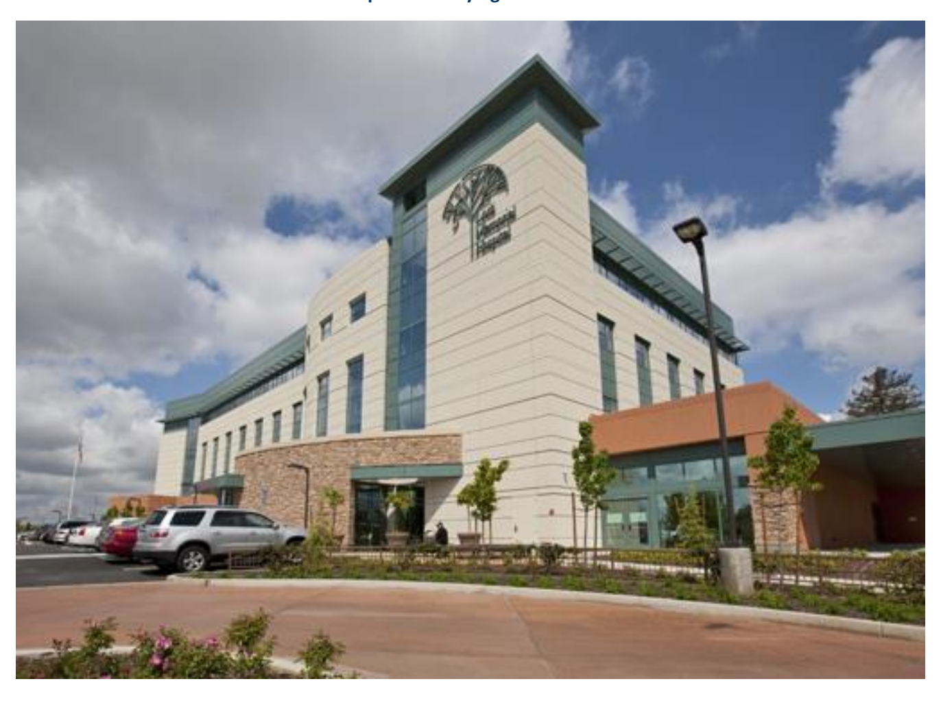
FACILITY CONTACT INFO AND BASIC STATS